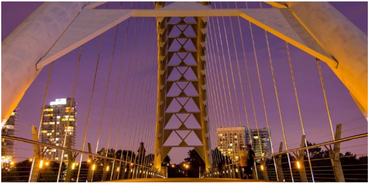
Humber Bay Arch Bridge, Etobicoke