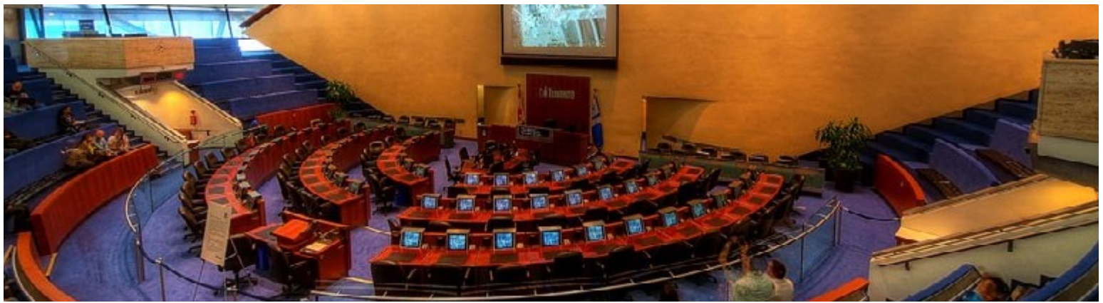
Toronto City Hall Council Chambers