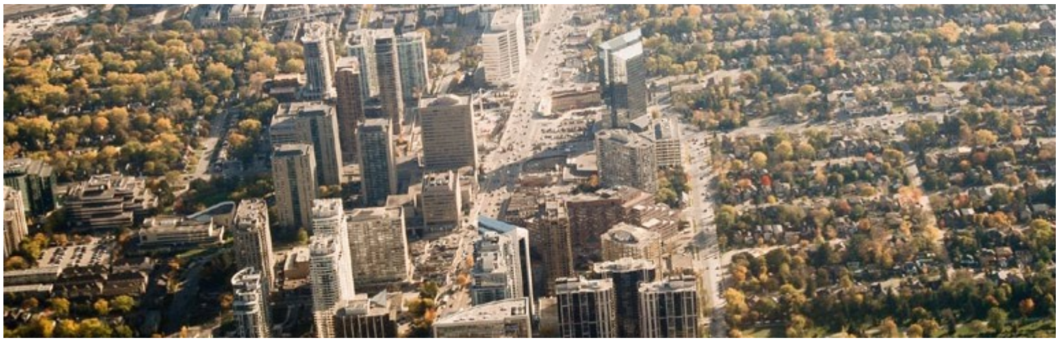
North York