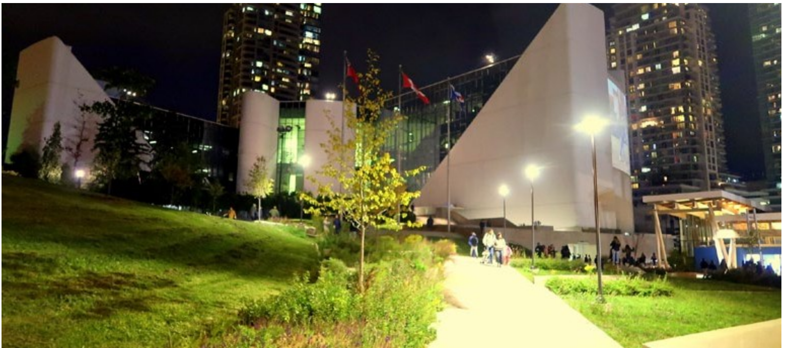
Scarborough Civic Center | Photo Credit: wyliepoon, Flickr